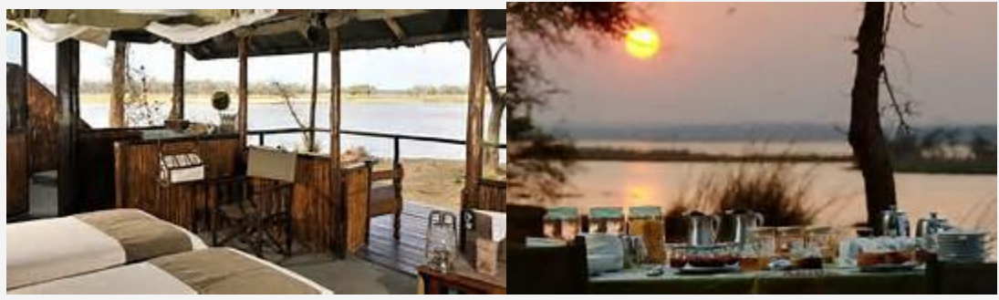
Day 7-10: Shumba Camp, Kafue National Park

You can either fly back to Lusaka and then on to the Lower Zambezi from there or take a direct flight from Tafika. Old Mondoro is also a small camp with only four rooms making it the smallest camp in the Lower Zambezi. The reserve is situated on the Zambezi River in the South of the country and is relatively new. The owners of Old Mondoro, the Cumings Family, brought the first guests to the park in 1990 and access is still heavily controlled resulting in very little human activity and one of Africa's finest wildlife experiences. Besides the day and night game drives, this is also a great area for walking and visitors can also enjoy canoe and boating safaris on the river.