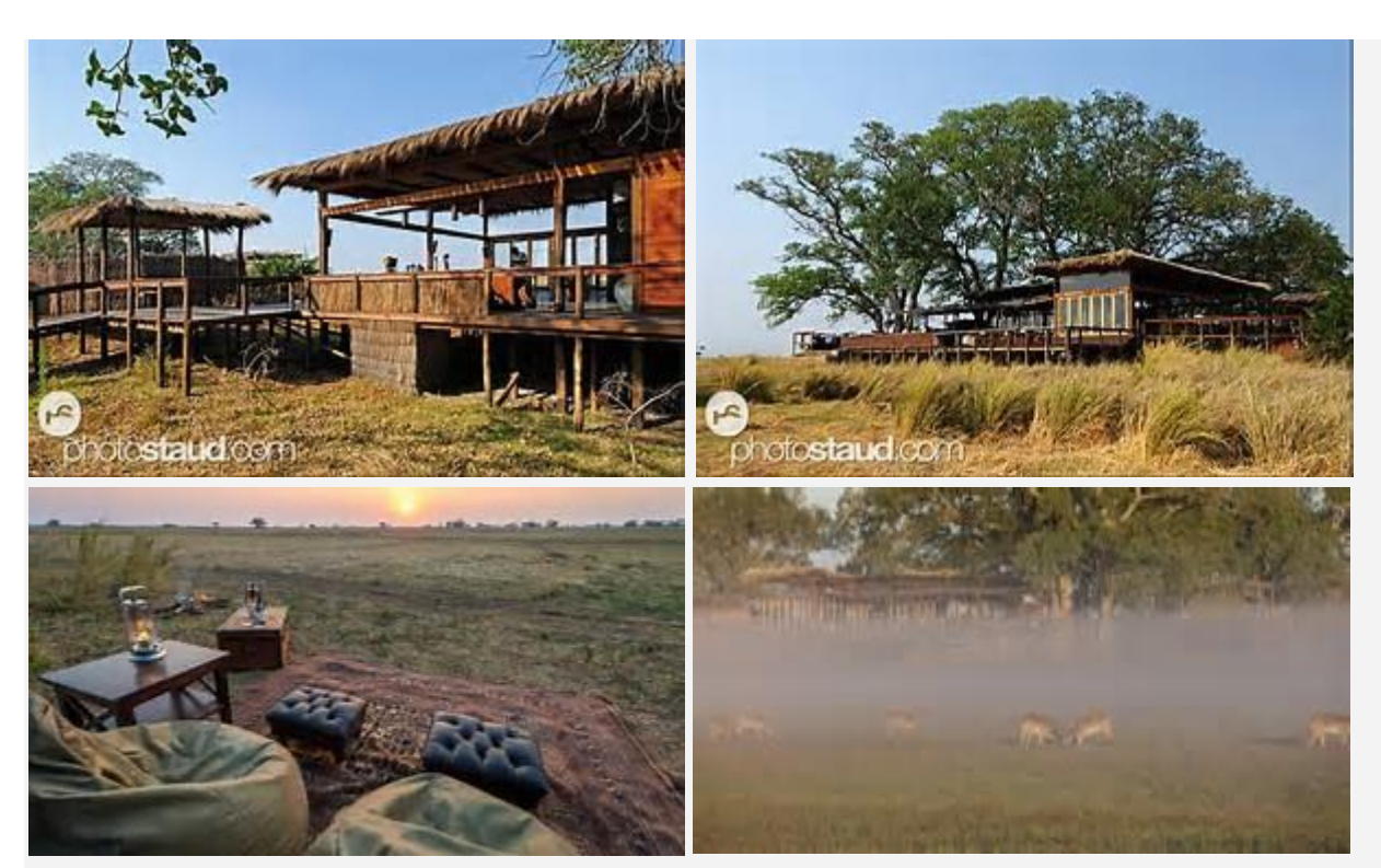
Day 10: Departure

There is one last spot of game viewing on your way to the airstrip for you flight back to Lusaka and home, or you can fly to Livingstone and add a few days in the Victoria Falls area to conclude your trip.