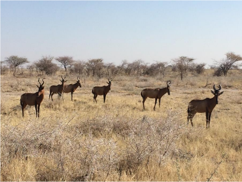
Overnight at Stanley lodge