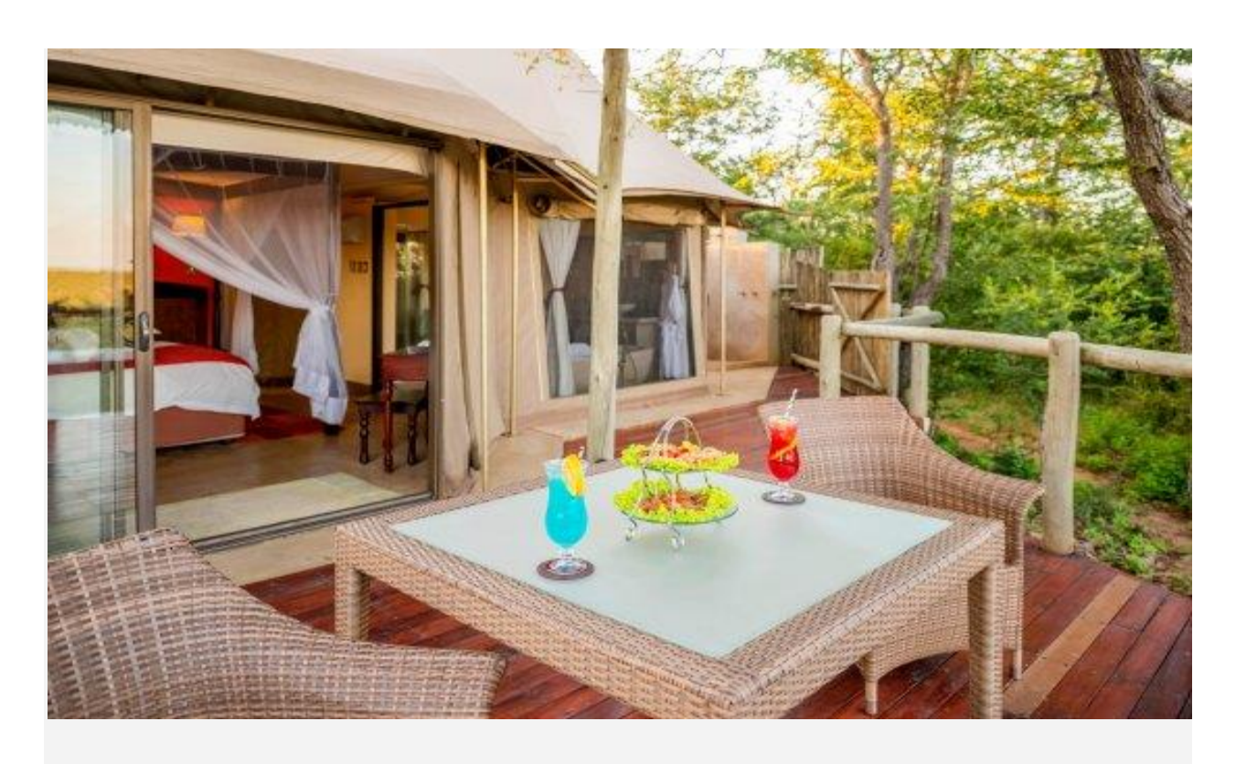
Day 6 - 9: MACHABA CAMP, OKAVANGO DELTA

Cross-border road transfer from Elephant Camp to Kasane Airport (approx 1.5 hours) and then a light aircraft transfer from Kasane to Machaba. Machaba Camp is situated in the game rich Khwai area, on the eastern tongue of the Okavango Delta. All the tents are situated on the ground, in the beautiful riverine treeline on the Khwai River, overlooking the famous Moremi Game Reserve. From these tented verandas, one can watch the daily parade of animals coming down to drink at the river in front of camp.