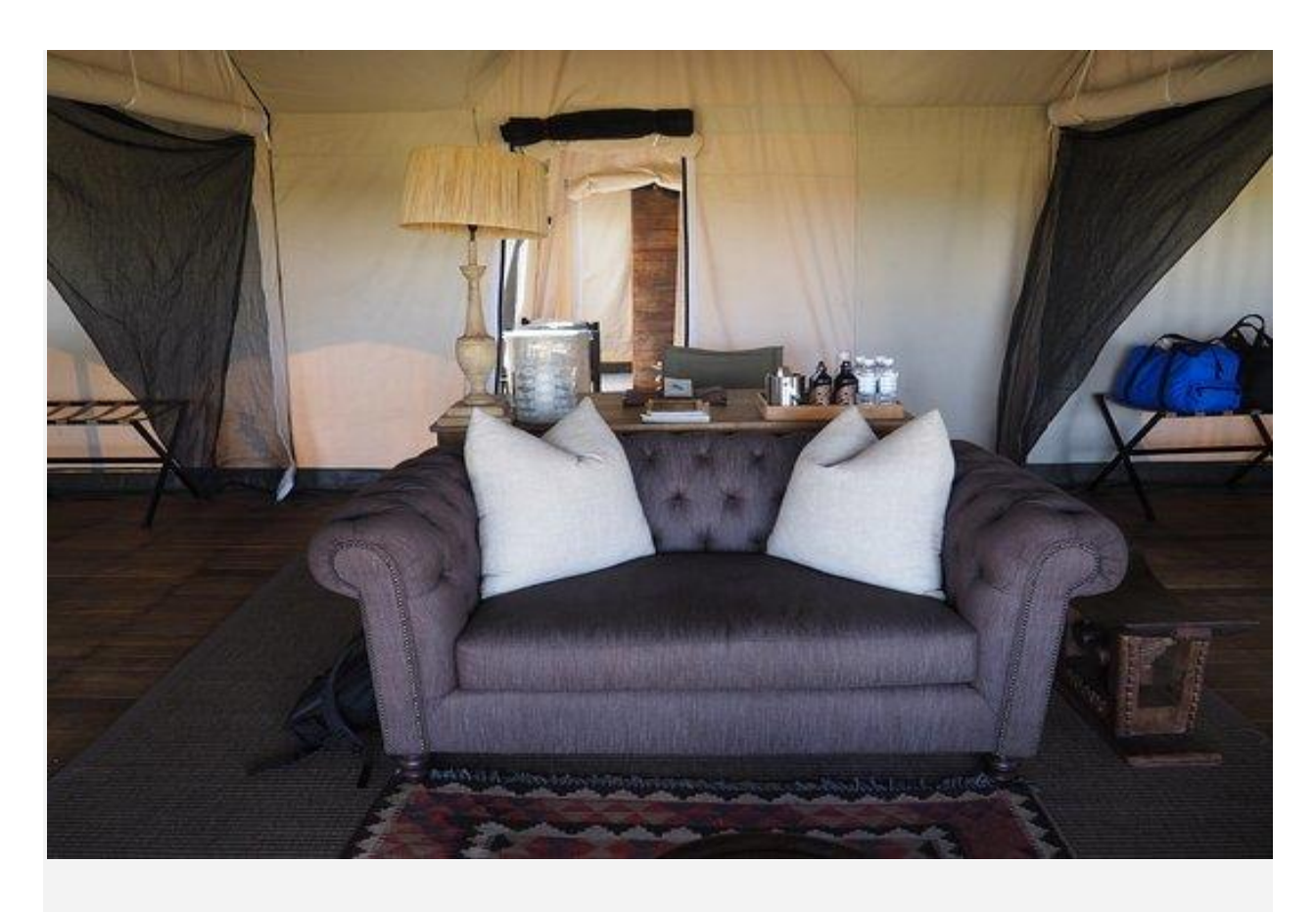
Day 9: Departure

Scheduled light aircraft transfer from Machaba to Maun Airport, where you can fly homewards or onto your next destination.