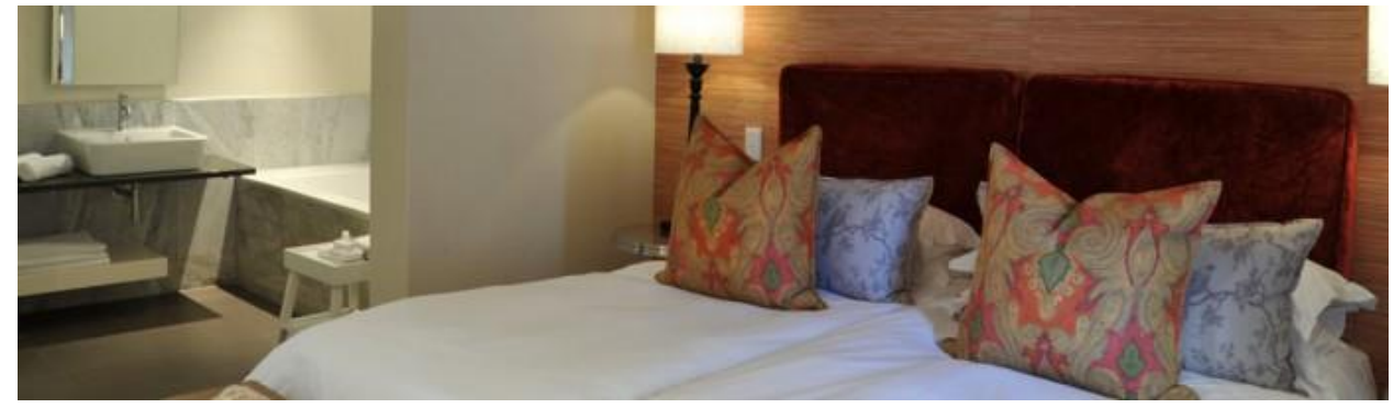
REX HOTEL STANDARD

Full day at leisure to explore Knysna. Why not board a ferry to the Featherbed Nature Reserve?