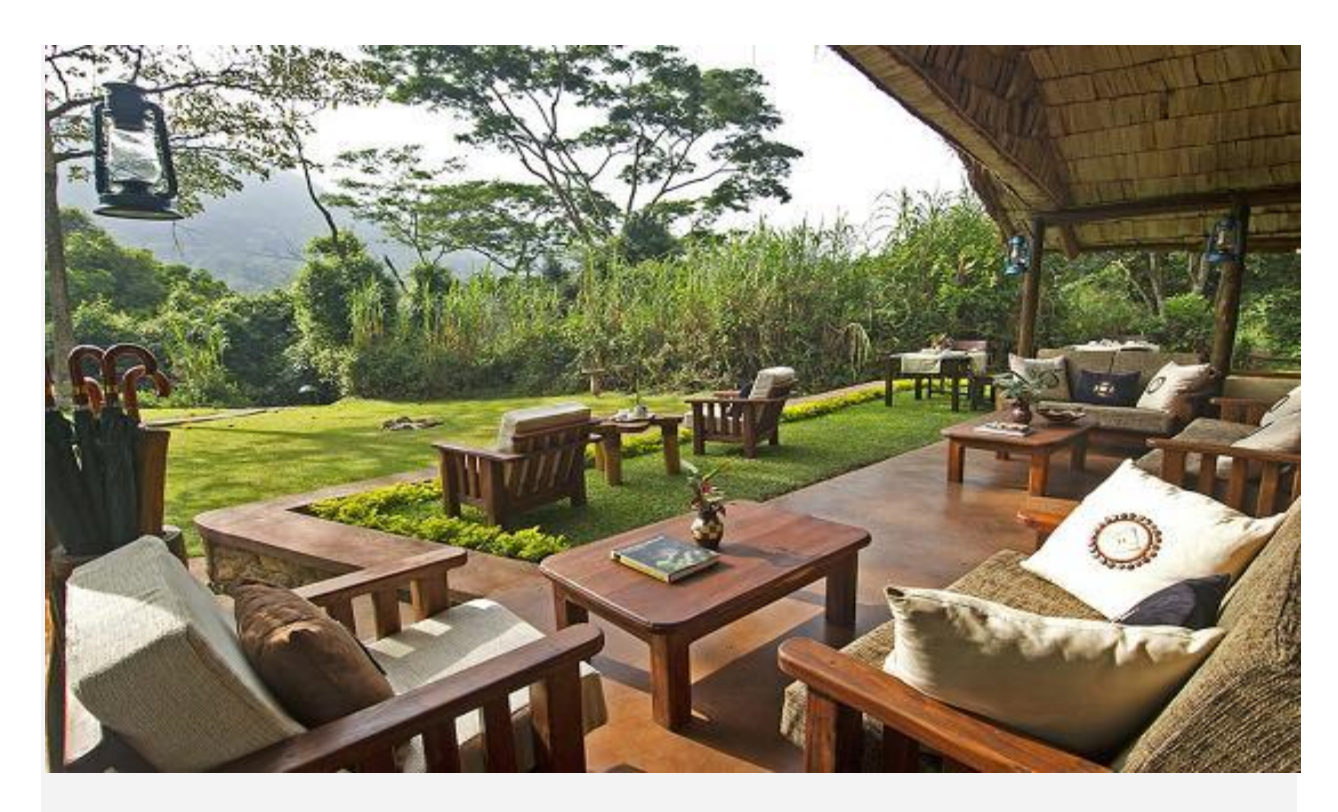
Day 11-14: SABYINYO SILVERBACK LODGE, VOLCANOES NATIONAL PARK

Depart for Rwanda where you'll stay in Sabyinyo Silverback Lodge, situated just one kilometre from the edge of Volcanoes National Park. Attention to detail, luxurious finishes and well trained staff are the hallmarks of this lodge with spectacular views. The primary reason to visit this area is of course for the gorillas. Volcanoes National Park is home to some 300 individuals and there are five habituated families that you can visit.