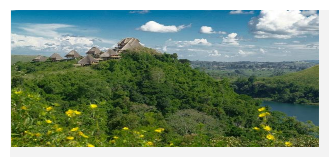
Day 6-8: QUEEN ELIZABETH BUSH LODGE, QUEEN ELIZABETH NANTIONAL PARK

Travel to Mweya Safari Lodge which faces out onto the teeming Kazinga Channel and Lake Edward. Enjoy a leisurely boat cruise along the channel. You may encounter herds of elephant, buffalo and antelope, families of warthog, large groups of hippos, and crocodiles basking on the shore. Go on game drives and spot elephant, leopard, lion and more wild beasts with your expert ranger.