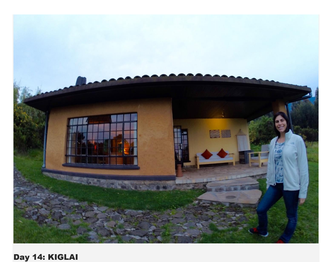
After breakfast, depart for Kigali and your flight home.